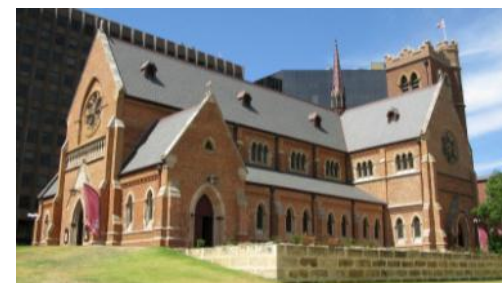
St George's Cathedral

Services will be celebrated at St George's Anglican Cathedral, St Mary's Catholic Cathedral and Wesley Uniting Church.