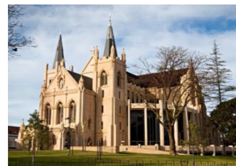
St Mary's Cathedral