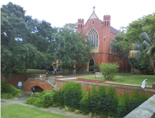
Chapel of St George's College above and front cover

If you wish, please email: sbyfield@three.com.au or ss12@rscmaustralia.org.au